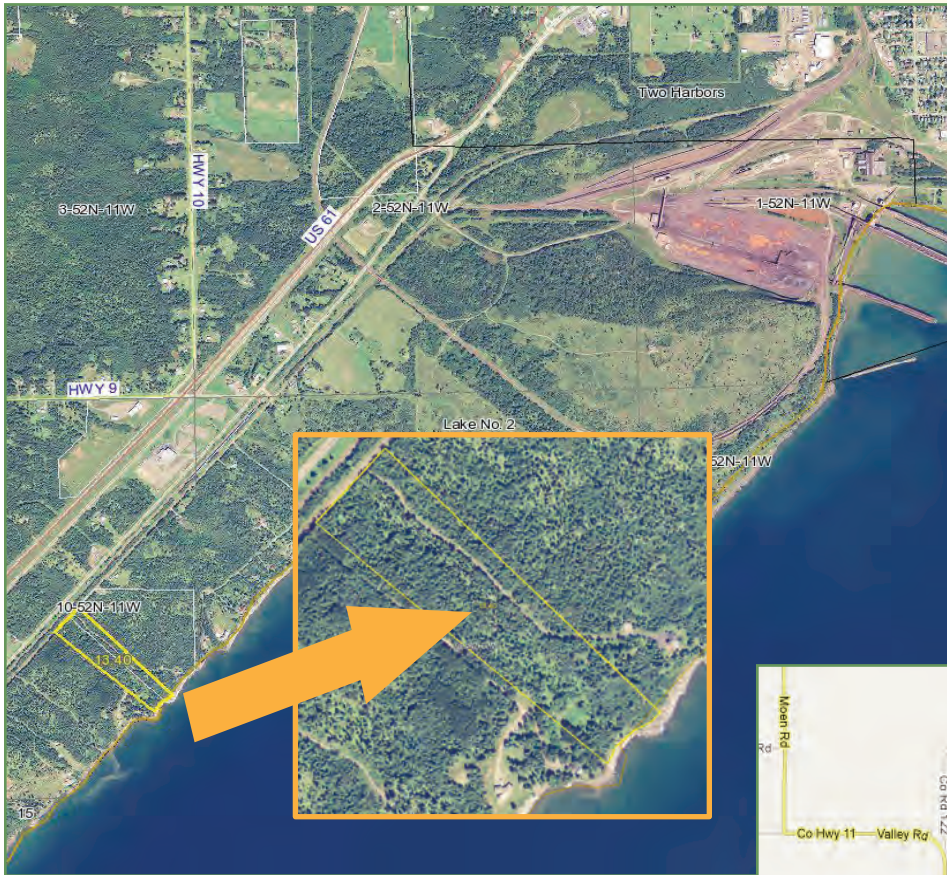
Lakeview Golf Course