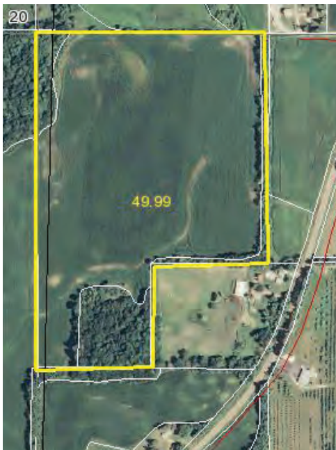
Rice County PID 1128225001